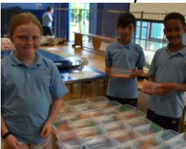
Supporting our local community