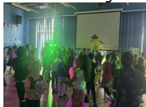
Children in need fundraising