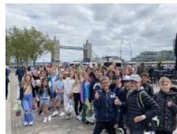
Visits to London