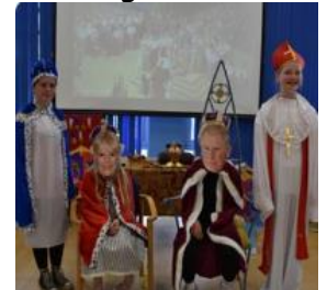
The King's coronation