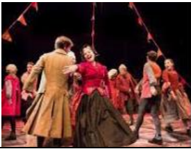
Experiencing the magic of the New Victoria theatre