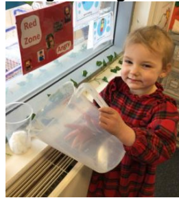
We grow together