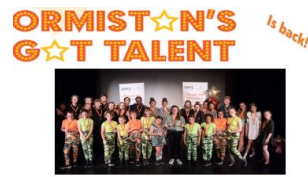
Showcasing our talents