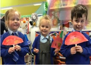
Thinking about people around the World