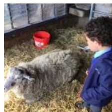
Learning about our local farm