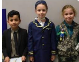
Educational visits linked to our topics