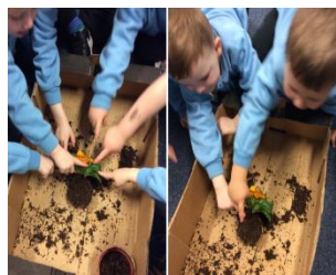
Embracing our local environment