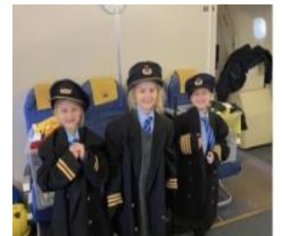
Learning beyond the classroom