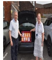
Providing meals for our local foodbank