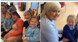
Learning about people in our community