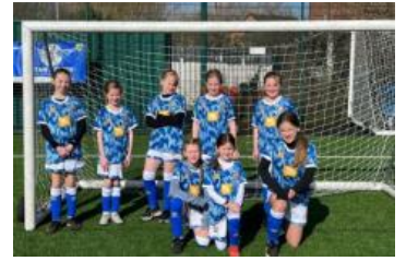
Our sporting stars