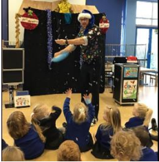
Social community Christmas