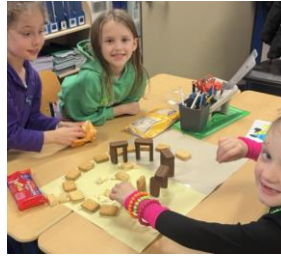
Understanding how History has shaped our future