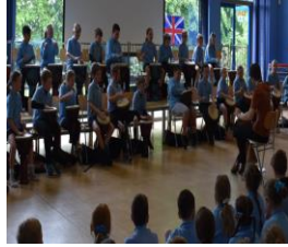
Appreciation and love for music