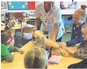
Working with Keele university