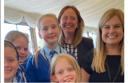
Gender equality for all 'Lifting limits'