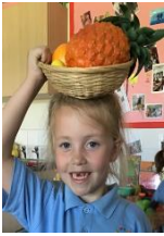
Visitors share their cultures and traditions